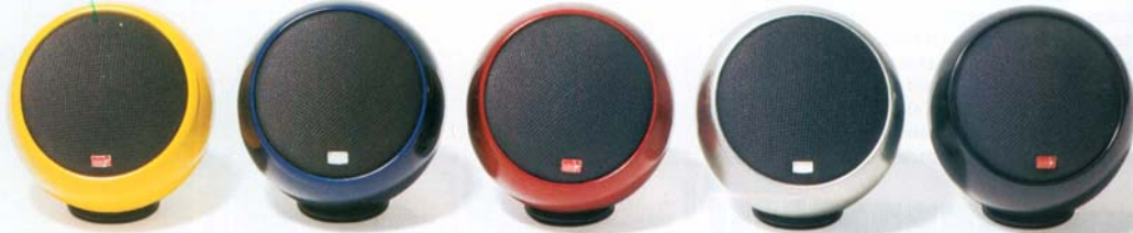
NUCLEUS MICRO $150 to $200 apiece

Remember your cousin Clarence with that huge misshapen head? He talked funny, didn't he? Maybe a tad shrill in the